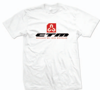
T-SHIRT - WHITE