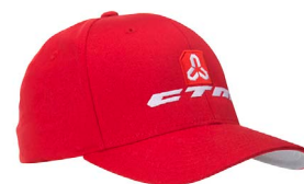
CTM ORIGINAL FLEXFIT CAP- RED