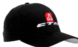
CTM ORIGINAL FLEXFIT CAP- BLACK