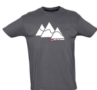
T-SHIRT MTB - GREY