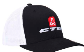
CTM ORIGINAL FLEXFIT CAP WITH MESH