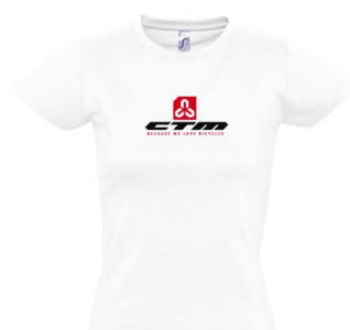
WOMEN'S T-SHIRT - WHITE