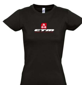
WOMEN'S T-SHIRT - BLACK