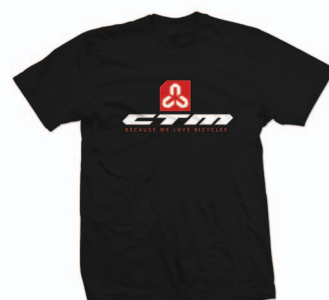
T-SHIRT - BLACK