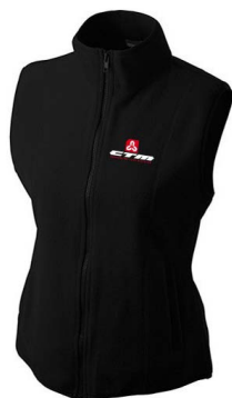
VSET WITHOUT SLEEVES - WOMEN'S