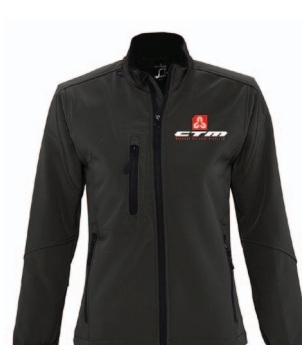
SOFTSHELL JACKET - LADY