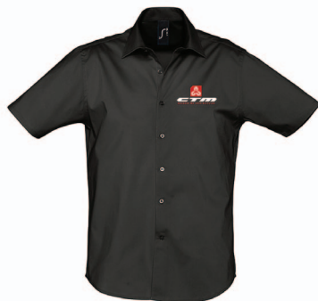
MAN SHIRT - SHORT SLEEVES