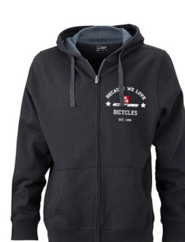
HOODIE - UNISEX