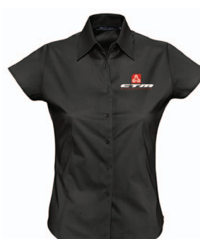
LADY SHIRT - SHORT SLEEVES