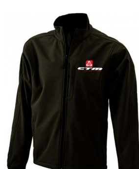
SOFTSHELL JACKET - MEN