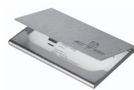
BUSINESS CARD HOLDER