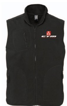
VSET WITHOUT SLEEVES - UNISEX