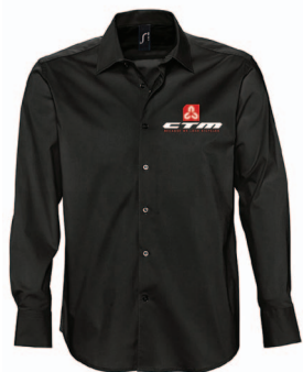
MAN SHIRT - LONG SLEEVES